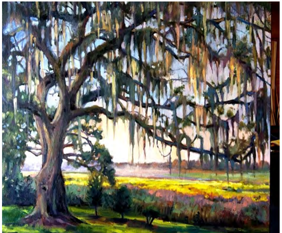
Tallahassee Landscape Painters: Painting the Panhandle January 5—27

5th Annual Paint-Out in the Historic Streets of Cedar Key